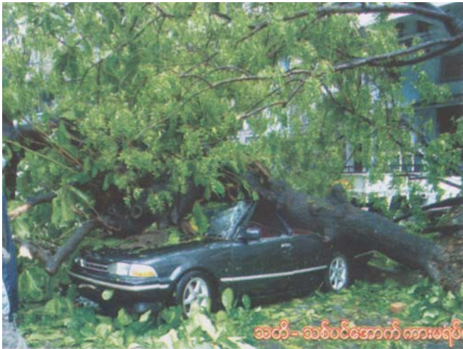
Damage caused by very severe cyclonic storm 'Nargis'

Under the action of wind flow, structures experience aerodynamic forces that include the drag force acting in the direction of the mean wind, and the lift force acting perpendicular to that direction. The structural response induced by the wind drag is commonly referred to as the 'along wind' response. It has been recognized that in the case of modern tall buildings which are more flexible, lower in damping, and lighter in weight than older structures, the natural frequency of