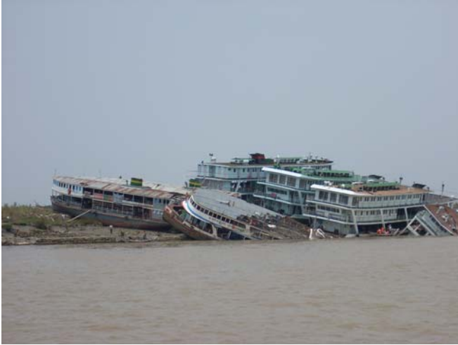
Storm surge caused by Very severe cyclonic storm 'Nargis'

and flooding of coastal regions. The surge is generated due to interaction of air, sea and land. When the cyclone approaches near the coast, it provides the additional force in the form of very high horizontal atmospheric pressure gradient and which leads to strong surface winds. As a result, sea level rises and continues to rise, as the cyclone moves over shallower waters and reaches a maximum on the coast near the point of landfall. Storm surge is inversely proportional to the depth of sea water. The depth varies from about 500 m at about 20° N in the north central Bay to about 5 m along the West Bengal-north Orissa coast. Because of the vast shallow continental shelf, the storm surges get amplified significantly in these areas. The northward converging shape of the Bay of Bengal provides another reason for the enhanced storm surge in these areas.