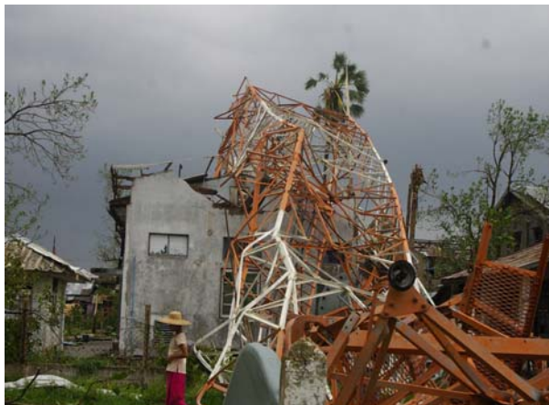
Damage caused by very severe cyclonic storm 'Nargis'

The damages produced by winds are extensive and cover areas occasionally greater than the areas of heavy rains and storm surges which are in general localized in nature. The impact of the passage of the cyclone eye, directly over a place is quite different from that of a cyclone that