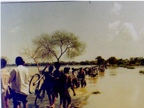
Flood cause by Orissa Super Cyclone

Rains (sometimes even more than 30 cm per 24 hrs) associated with cyclones are another source of damage. Unabated rains give rise to unprecedented floods. Rain water on the top of storm surge may add to the fury of the storm. Rain is a serious problem for the people who become shelterless due to a cyclone. It creates problems in post cyclone relief operations.